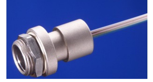
Circular MT receptacle